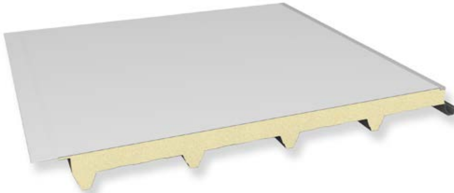
Particolare del giunto Joint detail

Roof double sheet panel with polyurethane foam insulation with flat coating in weatherproofing synthetic PVC or Polyolefin membrane