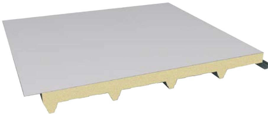
Particolare del giunto Joint detail

Roof single sheet panel with polyurethane foam insulation with flat coating in weatherproofing synthetic PVC or Polyolefin membrane